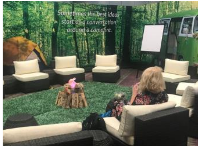
Roundtable conversations around a campfire in S320