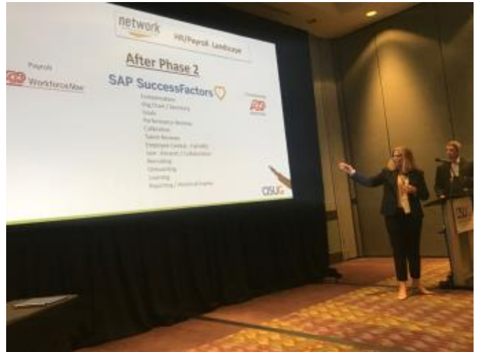
Customer Network Distribution's Journey to Cloud