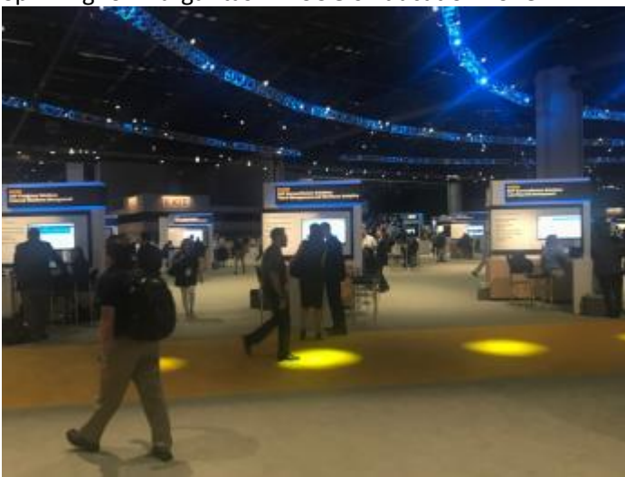
Attendees navigated the showfloor with GPS this year.