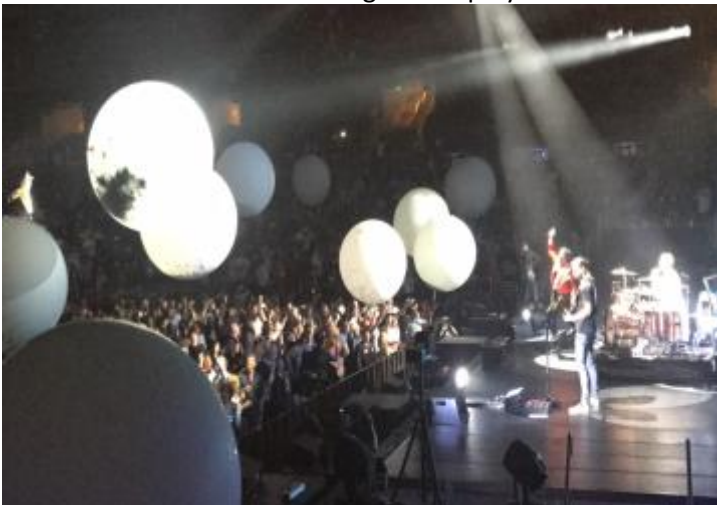
Entertained by Muse in the closing celebration concert.