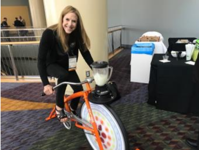
Spinning for margaritas in ASUG's Education Zone.