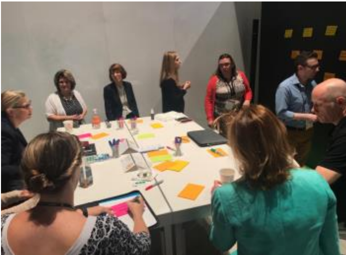
Interactive Influence Launching the Employee Central SIG